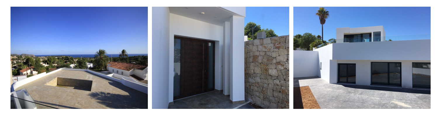
Important Notice: These details have been produced in good faith and are believed to be accurate based upon the information supplied but they are not intended to form part of a contract. You are strongly advised to check the availability of the property before travelling any distance to view. Any intending purchasers must satisfy themselves by inspection or otherwise as to the correctness of each of the statements contained in these particulars.

This new brand new designer villa is now KEY READY and from all floors offers views of the Mediterranean Sea. Located with good access to the coastal road Moraira - Calpe, the main house has 3 bedrooms, 2 bathrooms and 2 guest toilets and a spacious underbuild suitable for parking and for a future wellness area or bodega. IN ADDITION there is also a fully separate guest apartment with 1 bedroom and 1 bathroom with its own private entrance and terrace. The construction of this house is made using high-quality materials such as floor and wall tiles from the top quality tiling manufacturer APARICI: LAND series and quality carpentry and glazing from the German manufacturer Dopfner ensuring a favourable energy consumption for the villa. The construction has been carried out under an external control OCT and it comes with an external CEE certificate and a 10-year liability insurance through AXA. A splendid quality, luxury modern home in a privileged position.