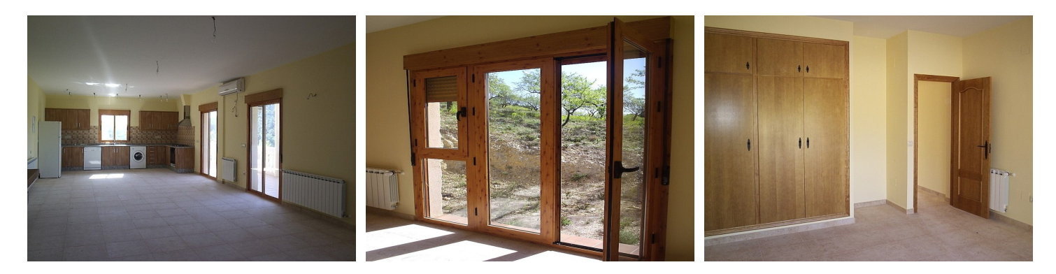
Important Notice: These details have been produced in good faith and are believed to be accurate based upon the information supplied but they are not intended to form part of a contract. You are strongly advised to check the availability of the property before travelling any distance to view. Any intending purchasers must satisfy themselves by inspection or otherwise as to the correctness of each of the statements contained in these particulars.

Massive, genuine price discount on this very spacious, quality country villa with panoramic uninterrupted views. Including very spacious salÓn, 2 bedrooms, 2 bathrooms, gas central heating, air conditioning, fully fitted kitchen and mains water. Mains elec has to be reconnected- details on reuest. It has a commanding, tranquil position but is not isolated, being just 10 minutes to shops and all facilities. Built by a British builder regardless of cost and now at a price less than construction costs. Around 2 hours pleasant drive to airports of Murcia, and Alicante. This is a splendid opportunity to acquire a modern country villa in a very privileged position but with the quite rare advantage of good access and mains services. Located between elche de la sierra, Molinicos and Riopar.