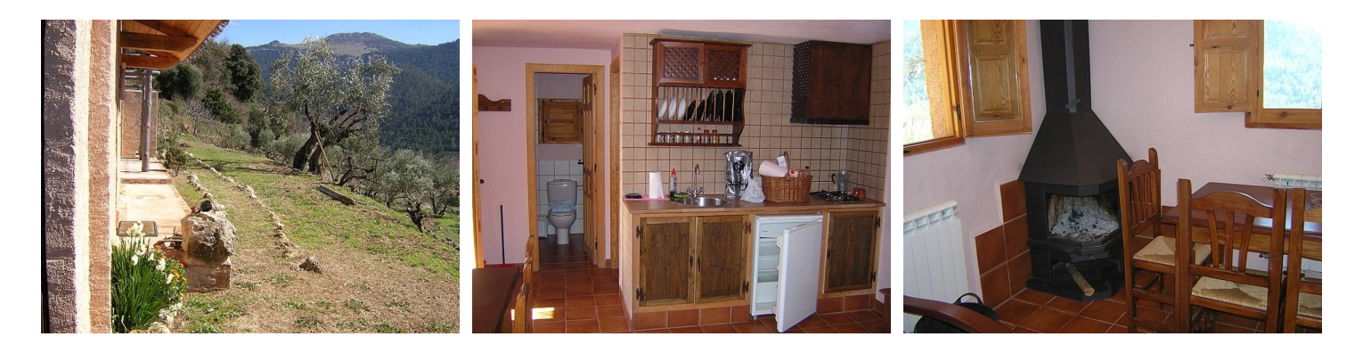
Important Notice: These details have been produced in good faith and are believed to be accurate based upon the information supplied but they are not intended to form part of a contract. You are strongly advised to check the availability of the property before travelling any distance to view. Any intending purchasers must satisfy themselves by inspection or otherwise as to the correctness of each of the statements contained in these particulars.

Now with mains electricity and abundant water are these two ground level compact houses separated by terrace. each comprising one bedroom, kitchen/salon, showeroom. Fully tiled. Could easily join over the terrace or live in one and rent out the other. Panoramic, uninterrupted views of mountains. Very private location yet near to all facilities. A "must see" property ! 15 easy mins to Riopar or Siles . Price is for all property as described, not just one.